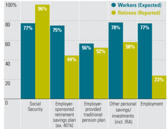
Source: Employee Benefit Research Institute, 2010 Retirement Confidence Survey.